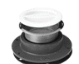
3.5" - 4" Opening