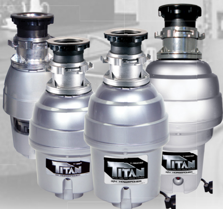
Batch Feed Units